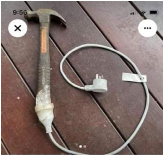
Electric hammer AU$20